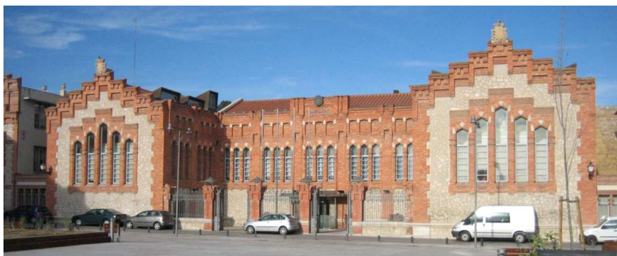
Rectorate Building of the University