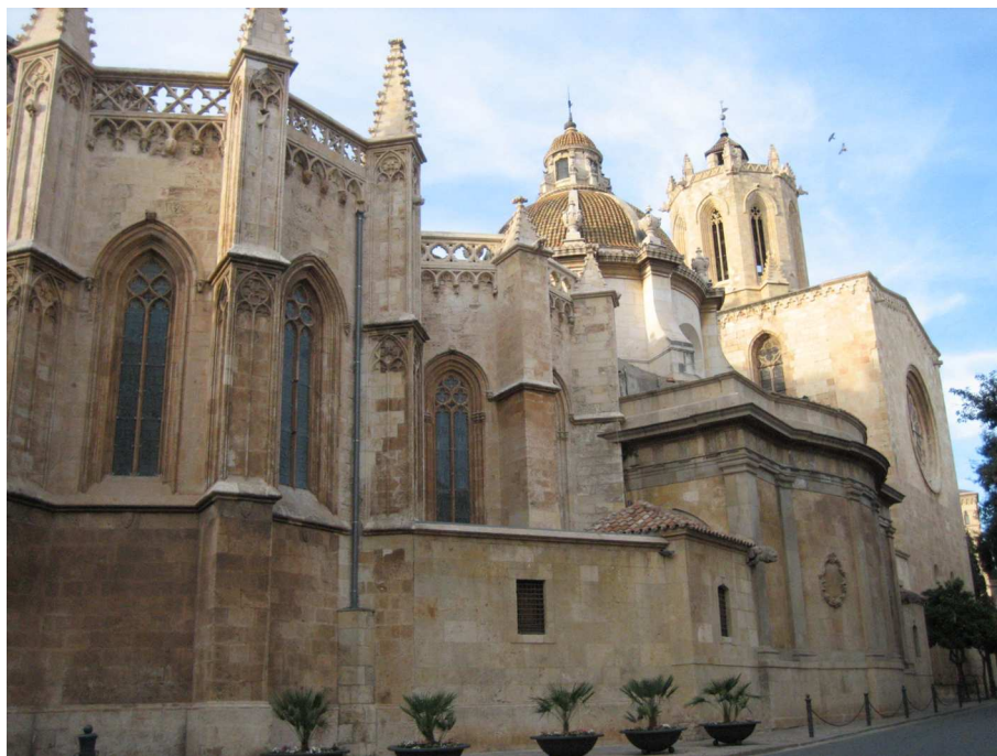
Cathedral of Tarragona